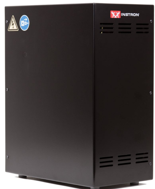
Self-Contained Electric Pump