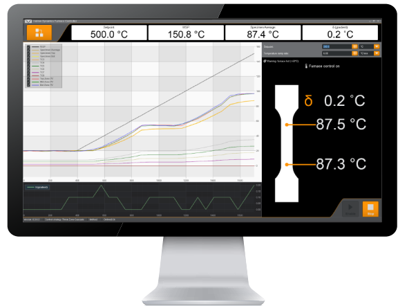
3117-301 Furnace Controller