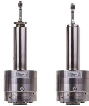
3117-501 LCF Pullrods