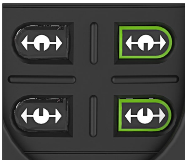
Integrated Grip Controls

As a technician it is important to be able to precisely set the preload on a specimen and achieve it consistently. While the technology to achieve this has been around for a long time, Instron is the first to utilise it in this application in simplifying and improving the quality of Low Cycle fatigue testing. It really is as simple as it sounds, set a pressure and push to close. Remove an unnecessary manual step in your test procedures and with it remove the variability between technicians.