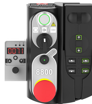
3117-503 Electrically Operated Pump with One-Touch Operation