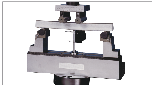
Four-point loading using mid point deflectometer