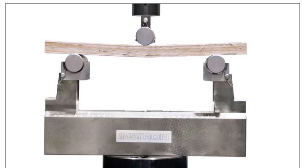
Three-point flexure fixture