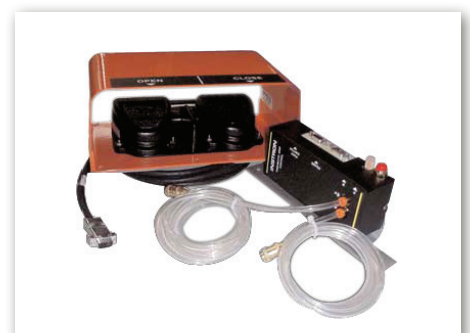
Automatic Air Control Kit for Pre-Tension Control