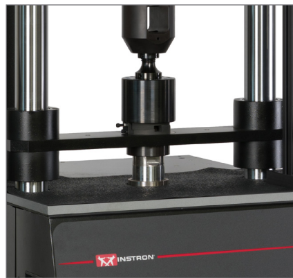
300LX with Linear Guidance option (H2)