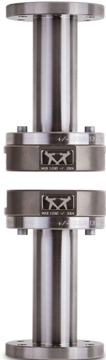
20 kN (4.5 kip) compression platens