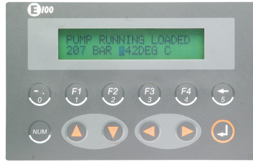
PLC operator interface

All models feature a fully integrated Programmable Logic Controller (PLC) with conveniently positioned operator interface panel. The PLC provides powerful control features in combination with the advanced circuitry of the 3520 series HPUs.