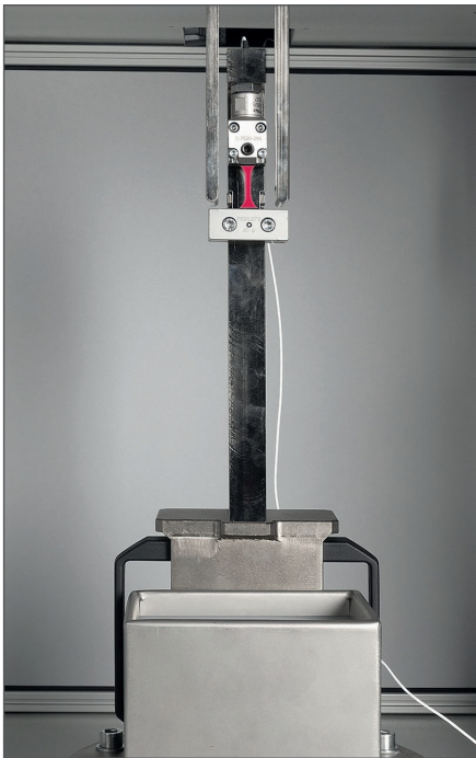
Vice and Tup for tests on Plastics

Static machines, primarily used for tensile tests, cannot reach moderate or high velocities and the only alternative for testing at high-speeds is to use servo-hydraulic testers. Since these systems often require significant support infrastructure and maintenance, the Impact Drop Towers of the 9400 Series can be a valuable option.