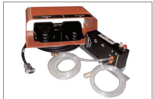
Automatic Air Control Kit for Pre-Tension Control