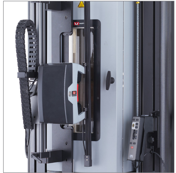
AVE 2 Mounted on a Temperature Chamber