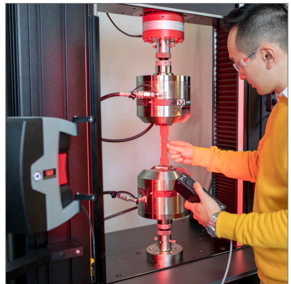
One Device, Endless Applications