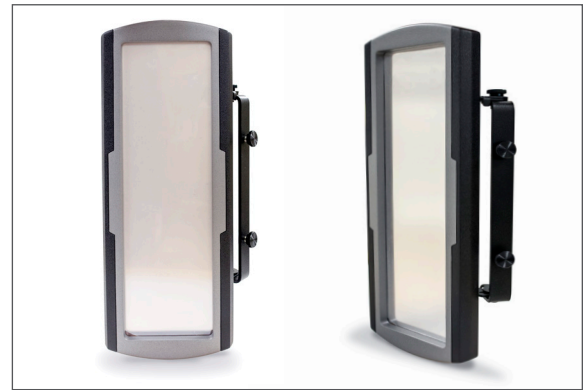
Passive Back Screen - part of Dual Use Lighting System

The AVE 2 runs on the same PC as the testing machine software. Requires Bluehill Universal V4.21 or later.