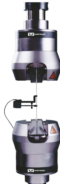
±30 kN (6.8 kip) fatigue-rated hydraulic wedge grips