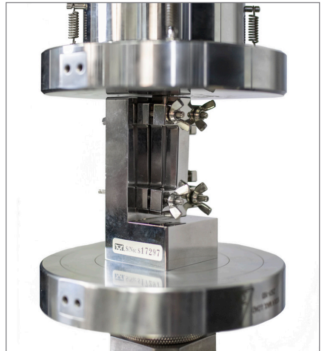
Anti-buckling fixture with base support end loaded between compression platens. The upper compression platen has a lockable spherical seat

When determining modulus strain measurement is required. Strain can be measured using a pair of strain gauges one on each side of the specimen (versions of the guide plates incorporating cut-outs to provide clearance for the gauges and wires are available). It is also possible to use clip-on or automatic extensometers.