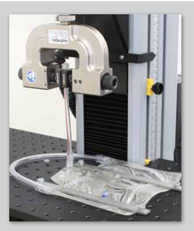
A 90 ^{\circ}\, pull test of the conducting tubing in a blood bag is performed on a universal system fitted with a tapped plate.