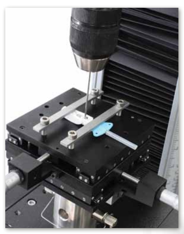
An XY-Stage is used to finely position a catheter during multiple push tests on the individual components.