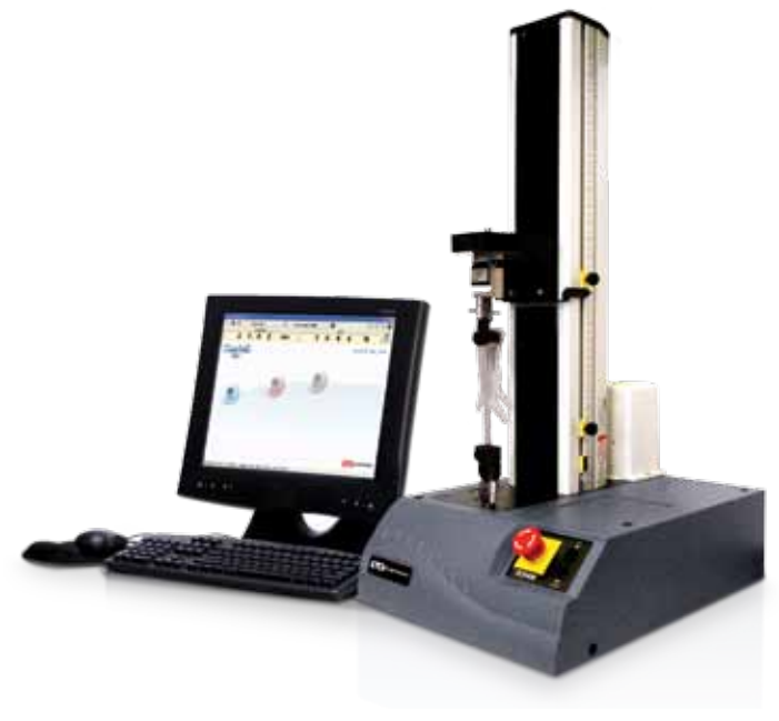
The 3342 500 N electromechanical system is suited to test a variety of catheters, tubing, syringes, gloves, and packaging

Medical consumables and equipment includes syringes, needles, sutures, staples, packaging, tubing, catheters, medical gloves, gowns, masks, adhesives and sealants for wound dressing and a whole host of other devices and tools used with a hospital or surgical environment. Depending on the device, mechanical testing can be carried out in tensile, compression or flexure, in dynamic or fatigue, or impact or with the application of torsion.